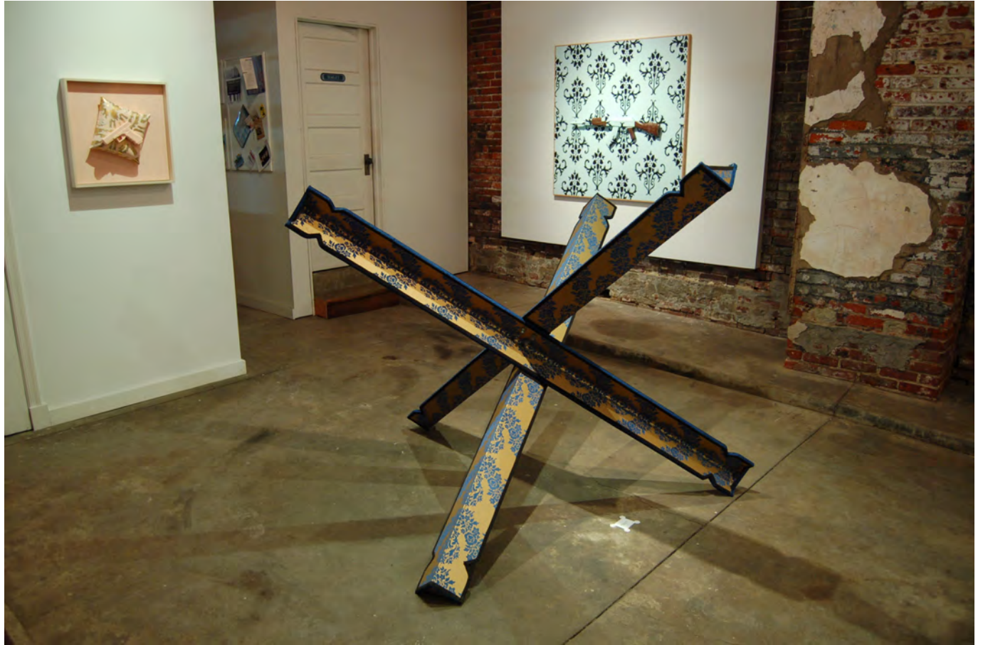
Hindrance, detail steel, paint, wallpaper, gyp 2014