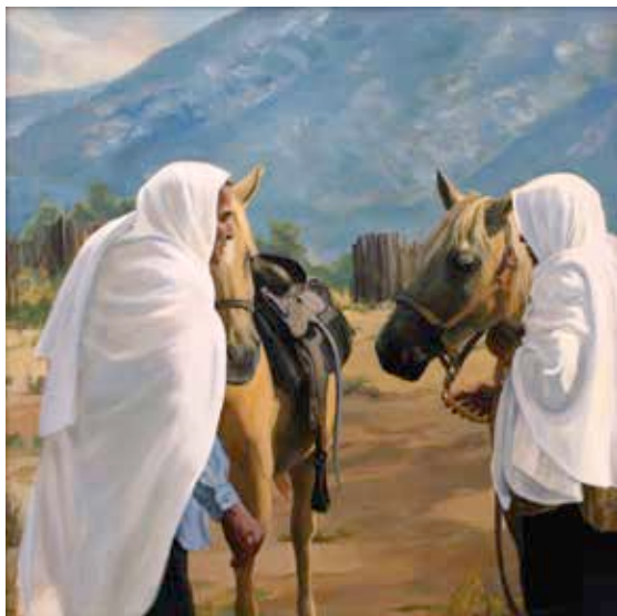
Ride to Blue Lake , oil on canvas, 40 x 40"