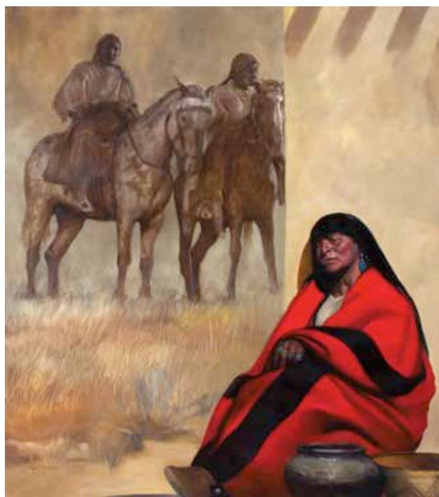
When We Were Young , oil on canvas, 54 x 48"

In his rhetorical thesis De Oratore , the Roman consul Cicero (106-43 B.C.), wrote about the "method of loci," a mnemonic device for remembering things from faces to numbers and lists. Today the device is often referred to as a Memory Palace .