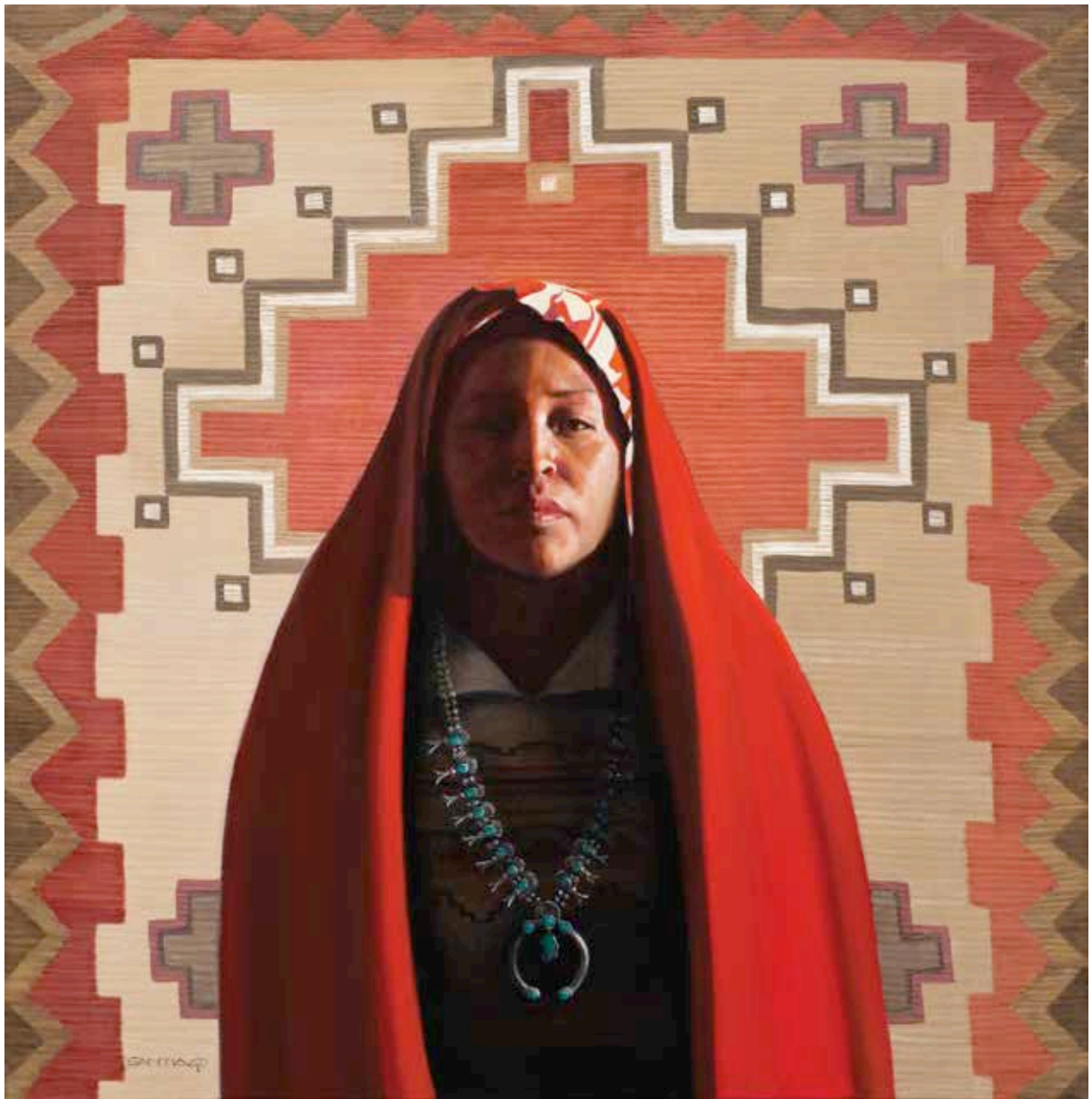
Weaver's Daughter , oil on canvas, 40 x 40"