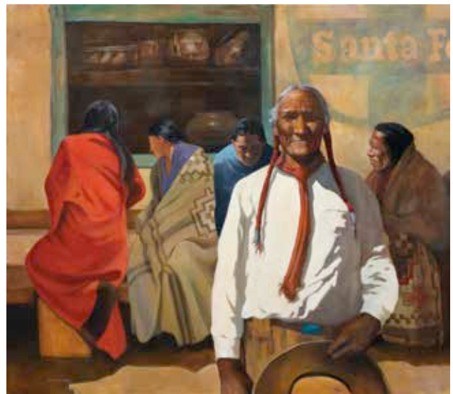
Guadalupe Street , oil on canvas, 42 x 48"