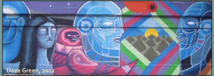
Doze Green, 2012