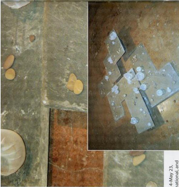
Laura Tabakman Rock Blossom Slate pebbles, polymer clay and silk, 2010.

SPACE, the largest of the three sites, featured a mix of large and small installations, sculptural and mixed-media pieces, and video works. Endless Column, Forem , by George Davis, tied rock to axis mundi symbolism, à la Brancusi. Davis paired shadowy film stills of mountains—ubiquitous axis mundi symbols—with a floor-to-ceiling column of carved limestone, evoking Brancusi's own symbolic Endless Column . Laura Tabakman's Rock Blossom , a floor installation of slate, pebbles, and silk and polymer clay, had the refined feel of a Japanese rock garden. Big Rock Candy Mountain: the Mine Tour , by