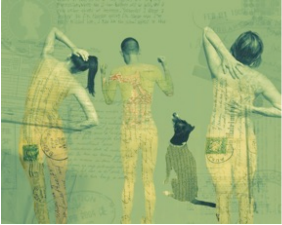
13. Introduction to Digital Media Scanned text and Image, 10" x 8"