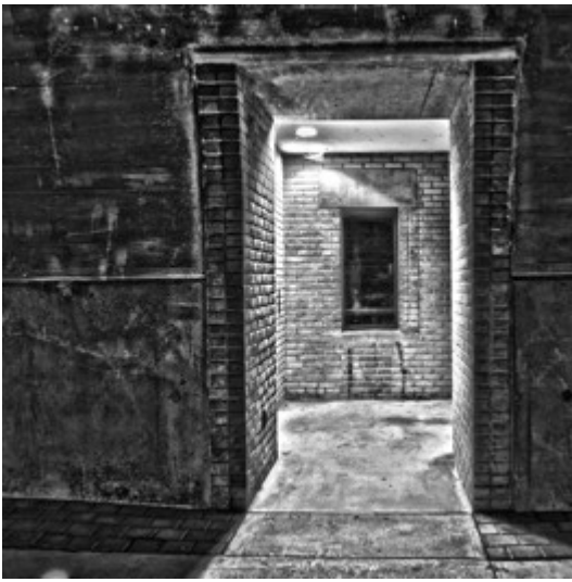
8. Introduction to Digital Photography High Dynamic Range Photograph, 15"x15"