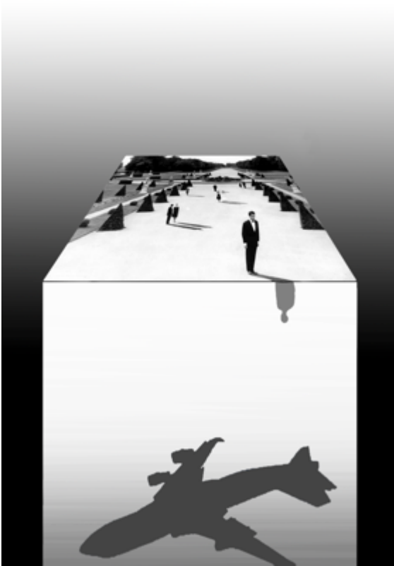
18. Introduction to Digital Media Portrait with Scanned Negatives, 12" X 18"