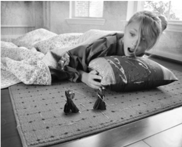
12. Introduction to Digital Photography Artist Emulation Project, 18"x12"