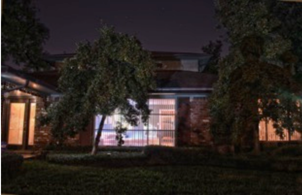
11. Introduction to Digital Photography High Dynamic Range Photograph, 18"x12"