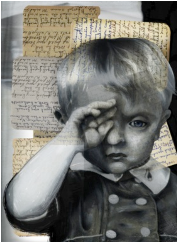
16. Introduction to Digital Media Family History with Pencil Drawing and Journal Entries, 11" X 14"