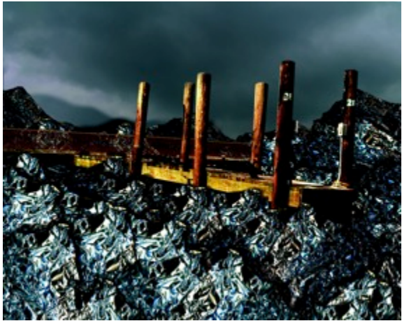
14. Introduction to Digital Media Digital Collage with Found Images and Aluminum Foil, 10" x 8"