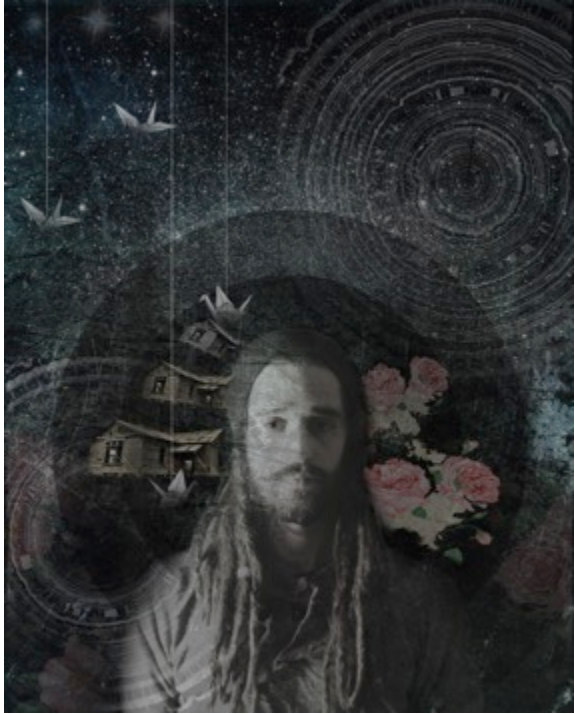
15. Introduction to Digital Media Self-Portrait with Film and Fabric, 10" x 12"