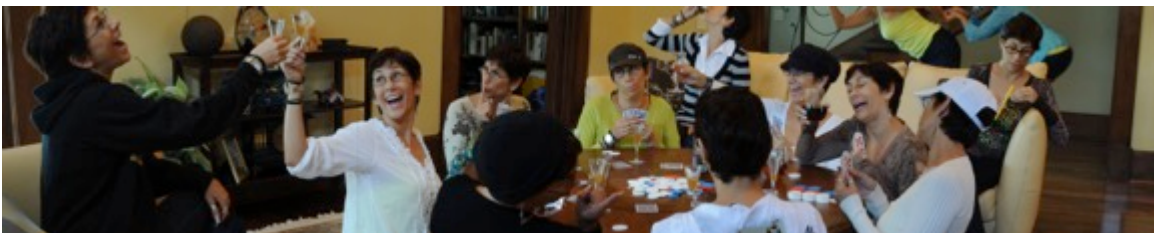
9. Introduction to Digital Photography Multiple Appearance Panorama, Dimensions Variable