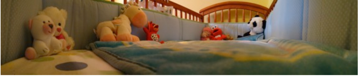
10. Introduction to Digital Photography Interior Panorama