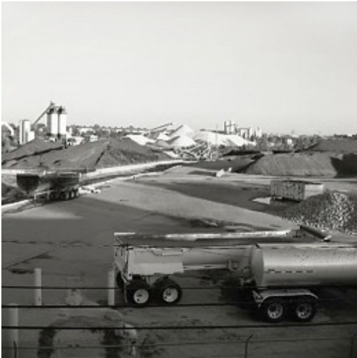
2. Intermediate Photography Medium Format Silver Gelatin Print, 19" x 19"