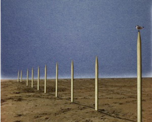
19. Introduction to Digital Media Composition from Scanned Objects, 10" X 8"