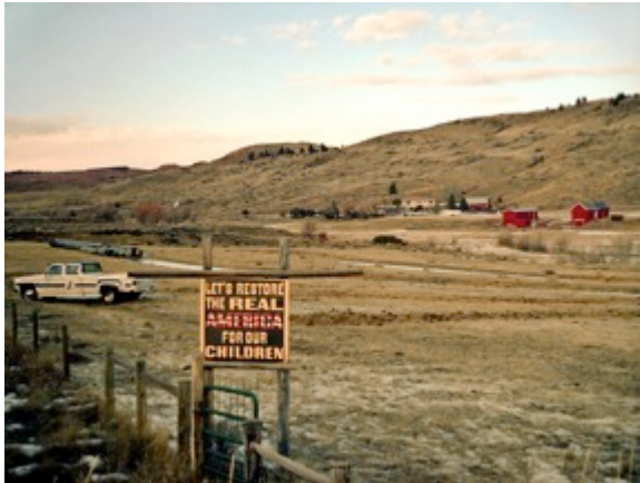
4. Intermediate Photography Ink Jet Print from C-41 Negative, 14" x 11"