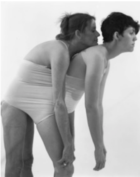
5. Advanced Photography Large Format Silver Gelatin Print, 16" x 20"