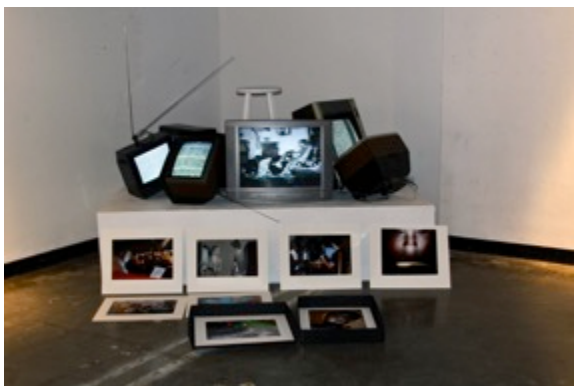
6. Advanced Photography Video and Photograph Installation, Dimension Variable