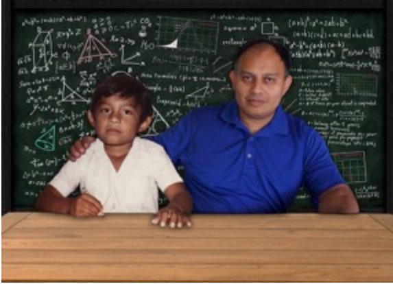
17. Introduction to Digital Media Family History, Connecting with a Younger Self, 11" X 14"