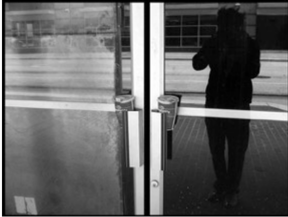
1. Introduction to Darkroom Photography Silver Gelatin Print, 10" x 8"